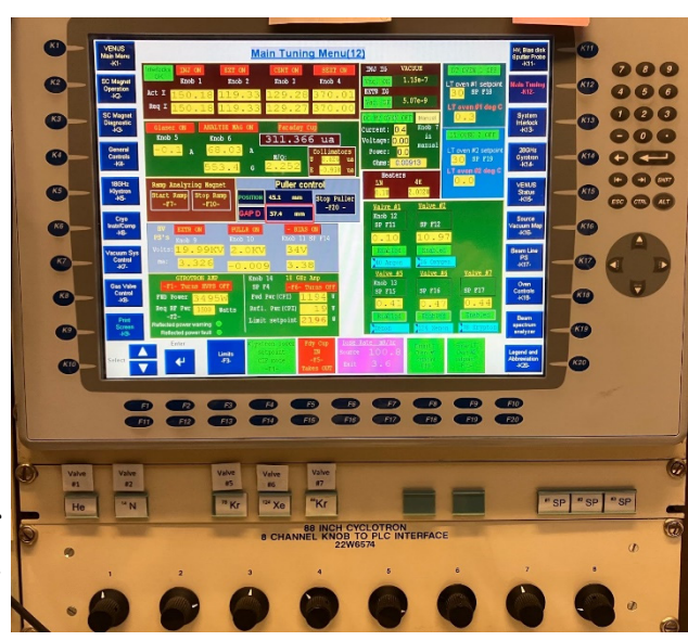
Figure 3: VENUS Panelview Plus 1500 PLC display showing the main tuning screen. The Panelview is touchscreen, has buttons and a numeric keypad to change or set parameters, and a collection of knobs below that allow for tactile fine-tuning.

Between plasma confinement, beam extraction, and system optimization, over 20 input variables are set by the source operator. For VENUS, this is done using a programmable logic controller (PLC) interface. Additionally, this interface constantly reads and displays over 80 source and beam line diagnostics. Beam optimization is challenging for human operators as the tuning space is large and transitioning from a local maximum to a higher maximum is difficult when faced with twenty possible adjustment variables and tens of diagnostics. Additionally, the 88-Inch Cyclotron and its users require that the source deliver stable beams for weeks-long campaigns. Maintenance of this stability is labor intensive [3] as the source must be monitored and corrective actions must be taken when control parameter drift occurs.