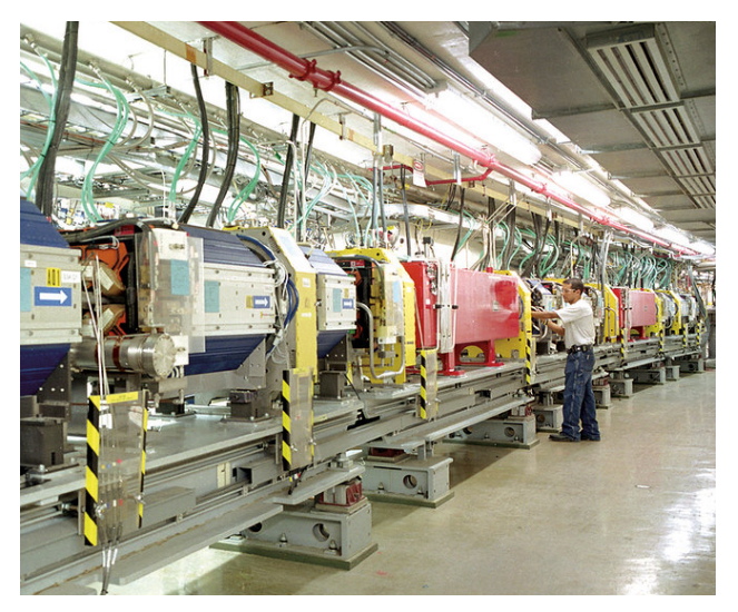
Figure 2: Photo of the APS storage ring within the accelerator enclosure [21]. Prominent in this image are the flexible tubing (aqua) serving individual accelerator components, connected to the water manifold at the ceiling. The fire sprinkler piping (painted red) is also visible along the ceiling.

Our principal goal is to obtain coverage of the accelerator with radiation monitors. If fast (< 1 s) time-resolved mea-